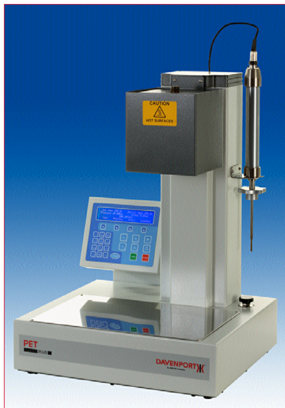
PET Plus - Unique test instrument for the Intrinsic Viscosity Measurement of PET .