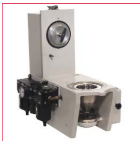
Quick Test Polymer Chip Grinder