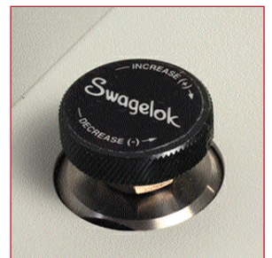
Nitrogen Regulation Valve (fitted as standard)