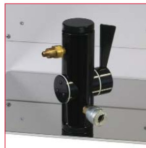
Polymer Chip Transfer Vessel