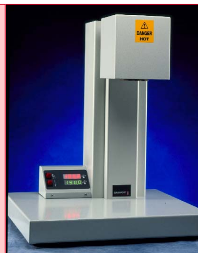
Melt Flow Indexer MFI-9